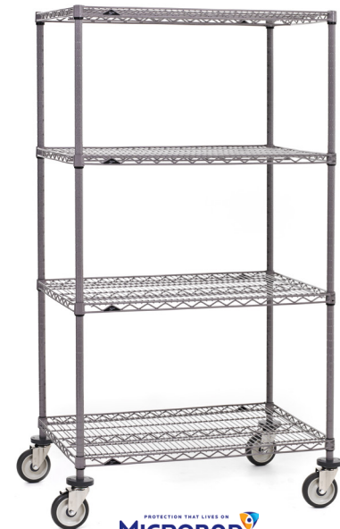
Super Erecta with Metroseal