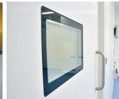
Optional flush vision panel