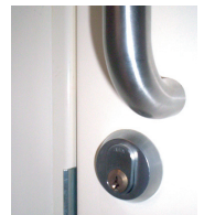
Factory fitted hardware