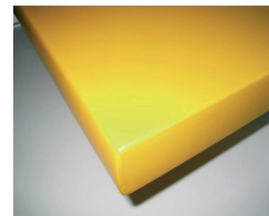
Seamless Fiberglass Door Panel